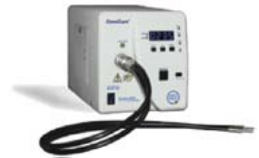
OmniCure ® Series 2000